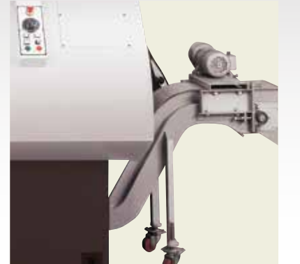
排屑機 Chip Conveyor