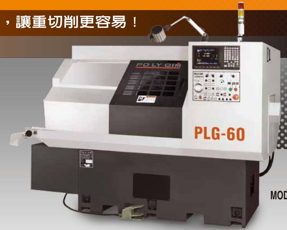
MODEL: PLG-52 PLG-60 PLG-75