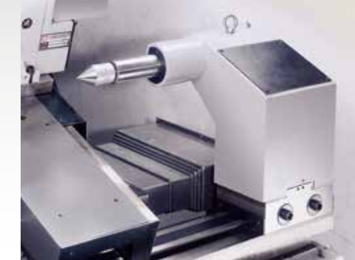
尾座 Tail Stock 可程式頂針行程100mm Programmable quill with stroke 100mm and MT4 taper.