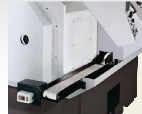
成品輸送裝置 Part conveyor